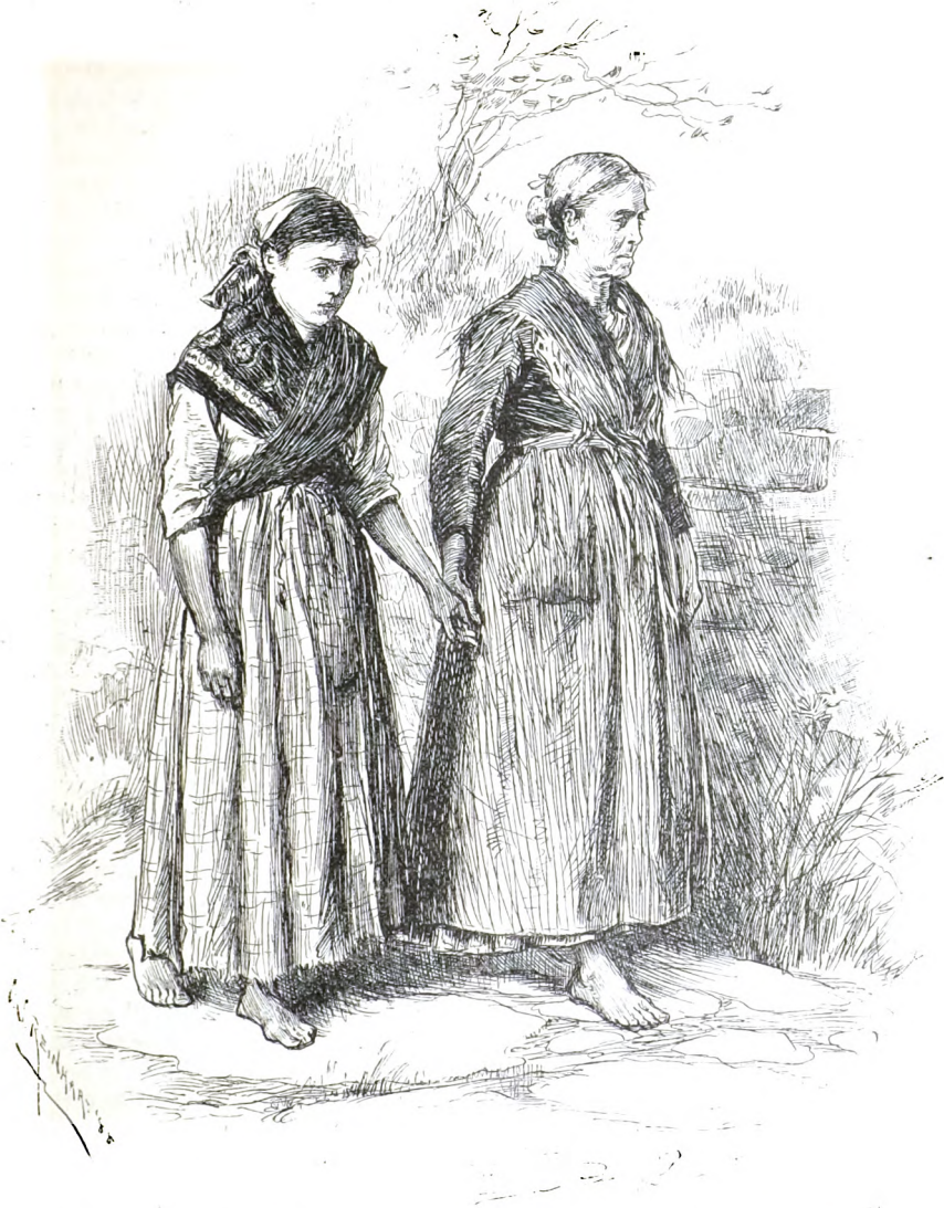
“STILL HOLDING NOUCE’S HAND, SHE WENT ROUND TO THE FRONT OF THE HOUSE.”

constantly loosen it. In the way of wraps, except her shawl, she possessed almost nothing; so she put on another gown over the one she wore, pinned her second flannel petticoat round her shoulders, and over that a little cloak that belonged to Nounce; then she tied a woollen stocking round her throat, and crowned with her bonnet, and carrying the blanket to put over her knees, she returned to her work.